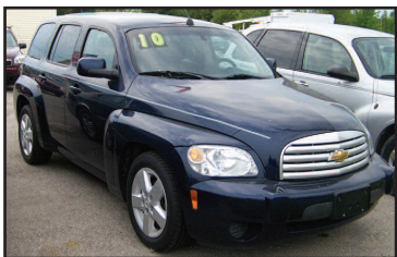
2010 CHEVY HHR LT Flex fuel, air, cruise. 3 to choose from. AS LOW AS $199/MO*