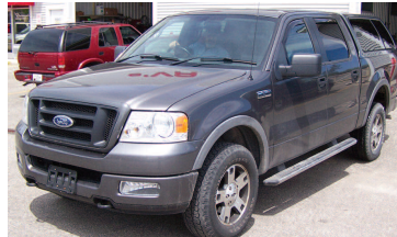
2005 FORD F-150 FX4 4WD, 115K, leather, loaded. Nice truck! ONLY $14,995