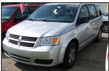
2010 DODGE GRAND CARAVAN 2 to choose from. Seats 7, Stow-N-Go, air, cruise AS LOW AS $229/MO*