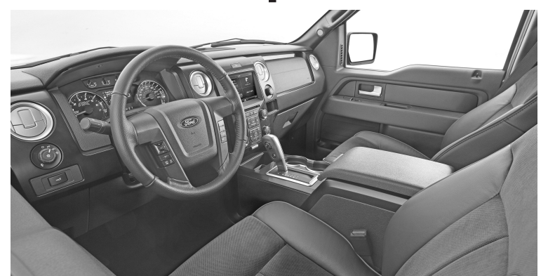
Customized interior touches include black leather seating surfaces with red trim, brushed-metal accents and a red-stitched steering wheel. Alcantara seat inserts add color and styling as well.

“The new Tremor gives F-150 customers yet another option to drive a highly capable, distinctive performance truck with fea-