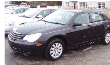
2007 CHRYSLER SEBRING Air, cruise, 4 cyl, great gas mileage AS LOW AS $149 A MONTH