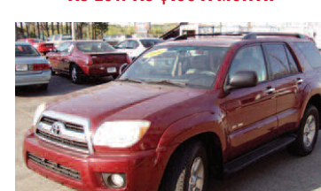
2006 TOYOTA 4 RUNNER Air, cruise, tow pkg. AS LOW AS $199 A MONTH