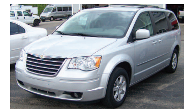
2010 CHRYSLER TOWN & COUNTRY Only 59K, seats 7, Stw-N-Go, auto doors. AS LOW AS $249 A MONTH