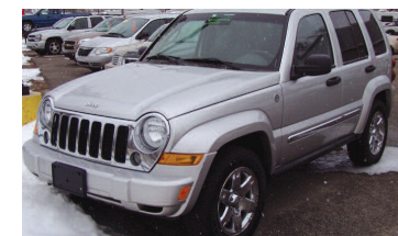
2006 JEEP LIBERTY LTD. 4x4, Sporty SUV AS LOW AS $199 A MONTH