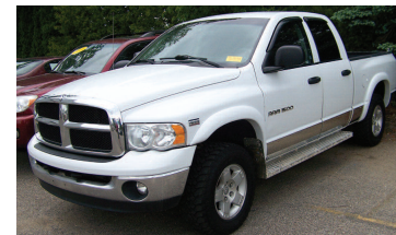
2004 DODGE RAM 1500 SLT QUAD CAB 4x4, seats 5, bedliner, tow pkg AS LOW AS $199 A MONTH