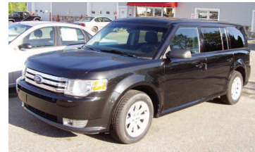
2011 FORD FLEX 7 passenger. Great family vehicle, 24 MPG. AS LOW AS $269 A MONTH