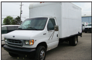
1998 FORD E-350 CUBE VAN Lift gate, 169K. ONLY $3,995