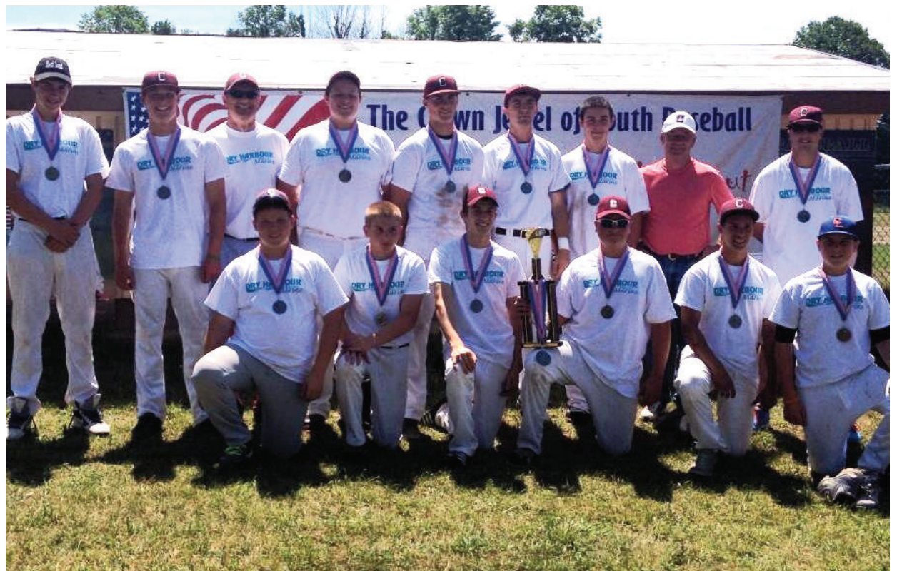
The 16U Dry Harbour baseball team finished runner-up in the Buddog Invitational.