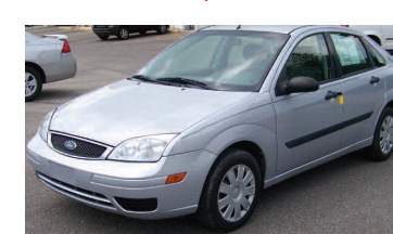
2005 FORD FOCUS ZX4 4 cyl, air, 29 MPG. AS LOW AS $199 A MONTH