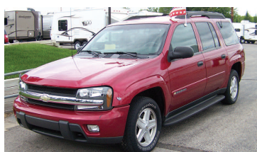
2003 CHEVY TRAILBLAZER EXT 4WD, seats 8, loaded, tow pkg AS LOW AS $199 A MONTH