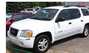
2004 GMC ENVOY XL 4WD, 3rd row seat, nice. AS LOW AS $199 A MONTH