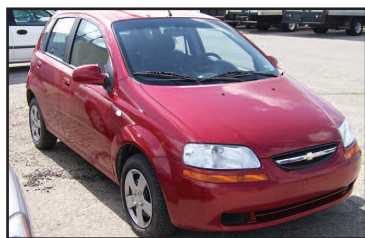
2008 CHEVY AVEO 5 5 speed, JVC sound, 34 MPG AS LOW AS $149/MO*