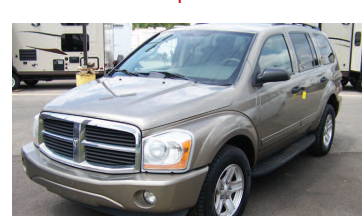
2004 DODGE DURANGO SLT 4WD, 5.7L Hemi, leather, air, cruise, seats 7. AS LOW AS $199 A MONTH