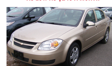
2007 CHEVY COBALT LT 29 MPG, air, cruise AS LOW AS $199 A MONTH