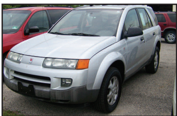
2003 SATURN VUE AWD, air, cruise. AS LOW AS $199/MO*