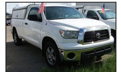
2008 TOYOTA TUNDRA SR5 Air, cruise, locking work box cover AS LOW AS $199/MO*