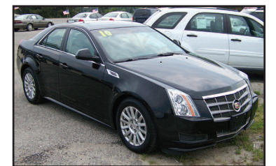
2010 CADILLAC CTS Leather, Loaded AS LOW AS $269/MO*