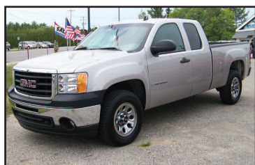
2009 GMC SIERRA Ext cab, 4x4, bedliner, seats 5, high miles AS LOW AS $249/MO*