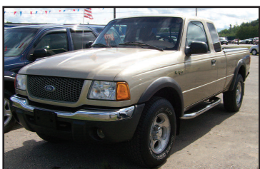
2001 FORD RANGER XLT 4x4 Off Road, bedliner, bedcover, air, cruise AS LOW AS $199/MO*