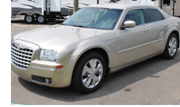
2006 CHRYSLER 300 Loaded. Nice car AS LOW AS $199 A MONTH