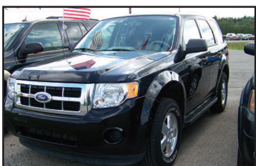
2012 FORD ESCAPE 4 new tires, air, cruise $15,900