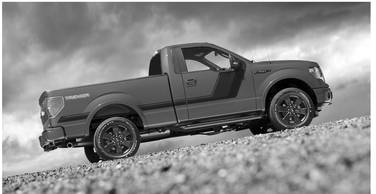
Tremor signals its sport truck capabilities with an appearance package that borrows the stealthy, flat-black accents, with a unique 20-inch flat-black wheel, a stylized bodyside graphic and black badges with red lettering from the FX Appearance Package.