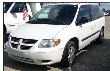
2005 DODGE CARAVAN Cargo Van SXT. Air, cruise AS LOW AS $199/MO*