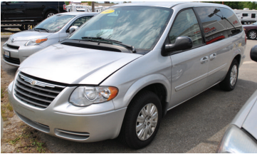
2007 CHRYSLER TOWN & COUNTRY LX 7 Pass, 4 captains chairs, air, tow pkg AS LOW AS $199 A MONTH