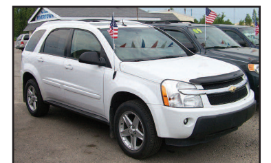
2005 CHEVY EQUINOX LT AWD, leather, sunroof. AS LOW AS $199/MO*