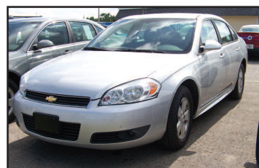
2010 CHEVY IMPALA Air, cruise, 29 MPG, nice AS LOW AS $199/MO*