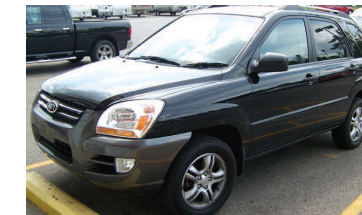
2006 KIA SPORTAGE LX Air, cruise, fold down back seat. AS LOW AS $199 A MONTH