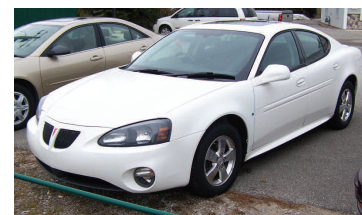
2007 PONTIAC GRAND PRIX 28 MPG, sunroof, OnStar AS LOW AS $199 A MONTH