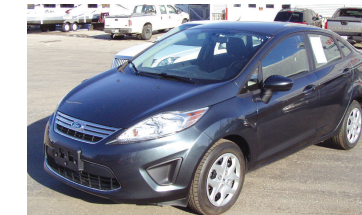
2011 FORD FIESTA Balance of factory warranty, sporty gas saver JUST $249 DOWN!