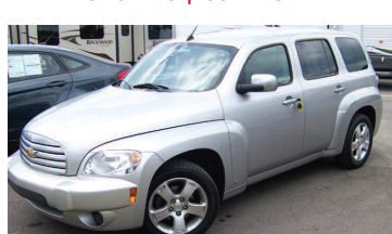
2007 CHEVY HHR LT Air, cruise. AS LOW AS $199 A MONTH