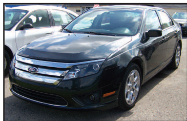
2010 FORD FUSION Air, cruise, good MPG, nice, clean AS LOW AS $199/MO*