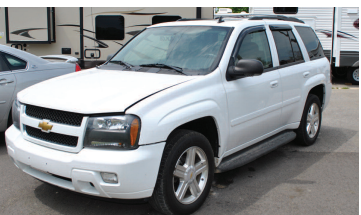
2008 CHEVY TRAILBLAZER LT 4WD, leather, tow pkg, nice AS LOW AS $199 A MONTH