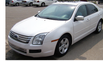
2009 FORD FUSION SE Sunroof, SYNC, loaded. A nice car with 28 MPG! AS LOW AS $199 A MONTH