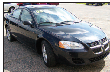
2004 DODGE STRATUS Sunroof, air, cruise AS LOW AS $149/MO*